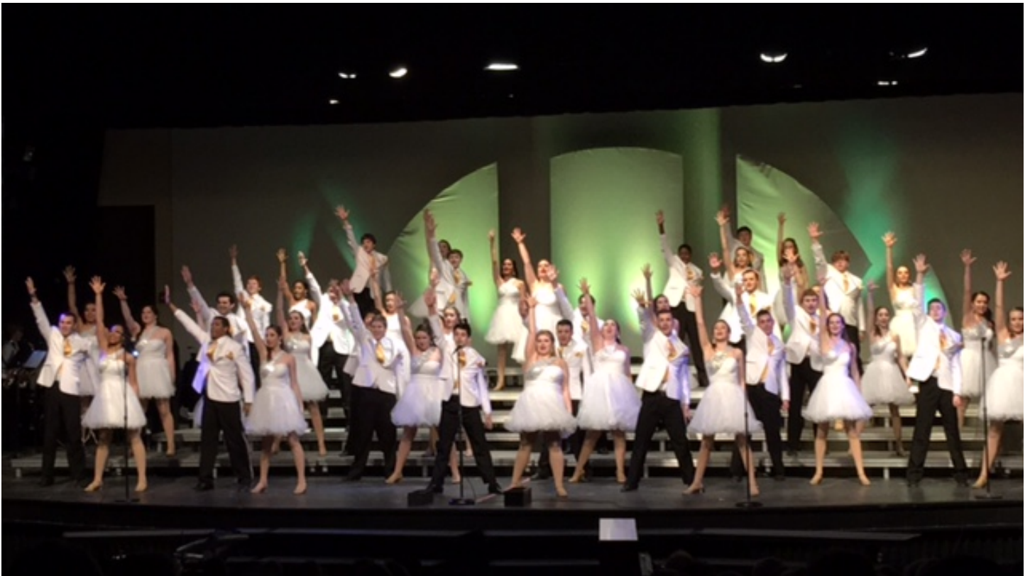
JUST FOR SHOW