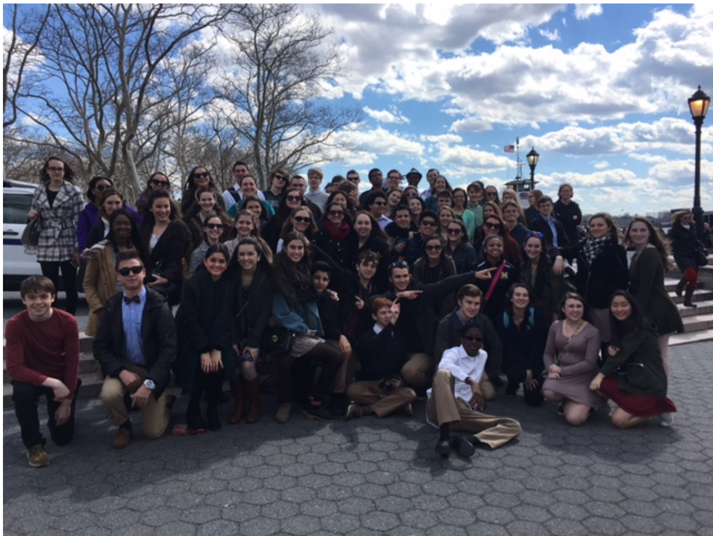
City Lights and Just for Show in New York City

Congratulations to both Show Choirs on outstanding performances this competition season!